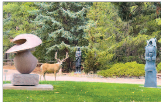
Glenn Green Gallery sculpture garden