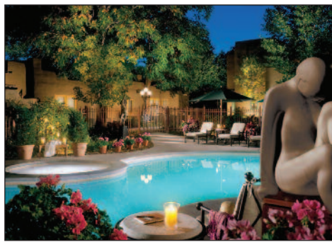
La Posada de Santa Fe lounge