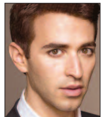
Anthony Roth Costanzo