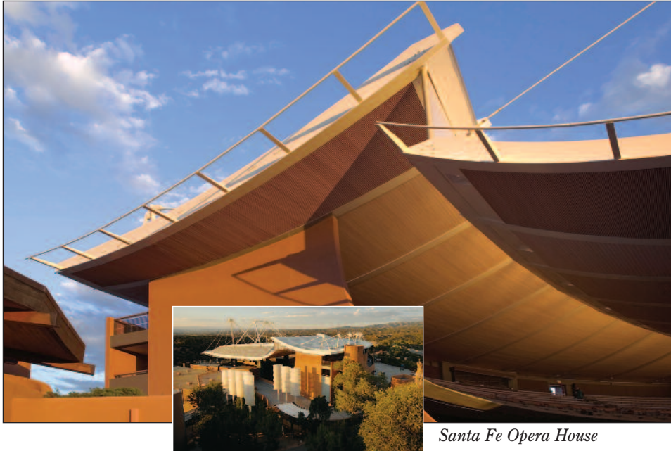
Santa Fe Opera House

Monday, August 5th through Saturday, August 10th