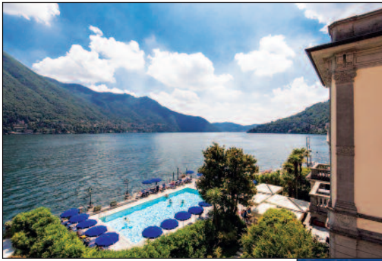
Grand Hotel Imperiale; Moltrasio

At 9:30 on Saturday evening, June 29th, we will return to the Arena for the acclaimed Franco Zeffirelli production of Giacomo Puccini's beloved final opera, Turandot . The scenic grandeur capturing legendary China compares with Zeffirelli's sensational MET staging, and Puccini's melodic score is replete with soaring arias and choral ensembles.