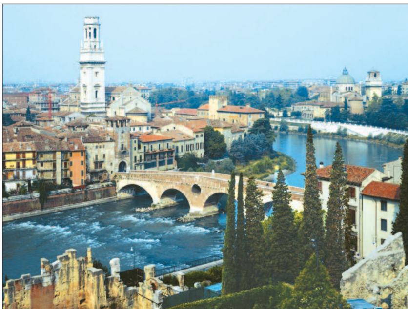
Verona on the Adige River

Tuesday, June 25th through Wednesday, July 3rd