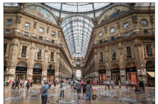
Galleria Vittorio Emanuele, Milano

Our limited time in Milan is left free for you to enjoy the city center on your own. Italy's exclusive designer boutiques and up-scale leather stores are conveniently