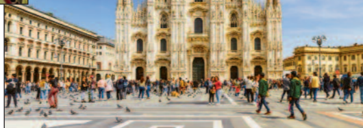
Duomo di Milano

At 8:00 pm on Tuesday, we are fortunate to attend a performance at the Teatro alla Scala , Italy's famous opera house. Our opera will be a new production of Jules Massenet's 19th century French landmark, Werther , based on Johann Goethe's eponymous romantic novel which was the most widely read book of its era. In the demanding title role (highlighted by the passionate aria, Pourquoi me réveiller ), we will hear the MET's exciting new star tenor Benjamin Bernheim . Opposite him as Charlotte will be mezzo-soprano