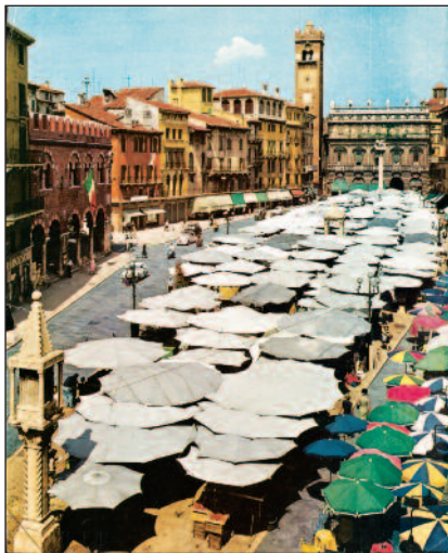
Piazza delle Erbe, Verona

Friday evening, June 28th, a pre-opera dinner of Veronese dishes will be served at Il Torcolo or La Griglia . Both of these inviting 'ristorantes' have been favorites with our former travelers.