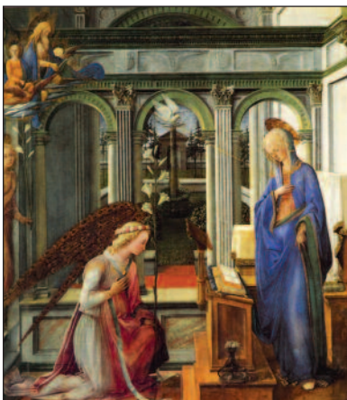
Fra Filippo Lippi's Annunciation in the Alte Pinakotek

Saturday, July 15th, is left free during the day for independent activities. During our several free mornings and afternoons, you should spend some time strolling through the woods and fields of the spacious English Garden, where the local population enjoys nude swimming and sunbathing along the fast-running waters of the Isar River. Also not to be missed are the Alte Pinakothek's priceless collection of European masters, re-opened in 1998 after extensive renovation; the Neue Pinakothek, in a modern circular gallery of unusual architectural beauty; and the Glyptothek museum of classical antiquities. Munich also offers a wide variety of international boutiques and designer shops.