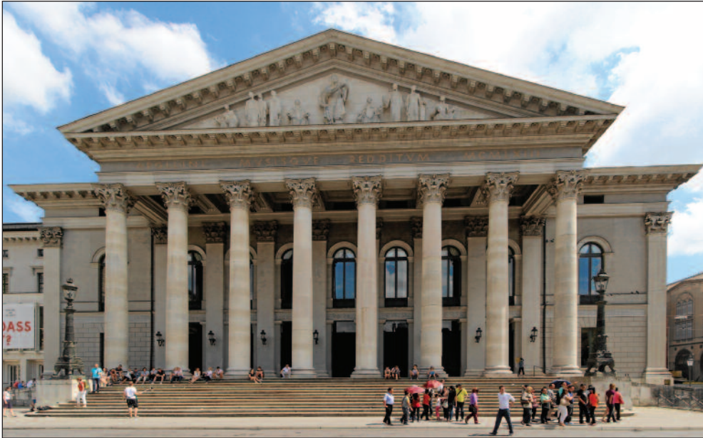
National Theater, home of Bavarian State Opera

“Munich’s Opera Festival, a mix of brand-new productions, stagings from the past season and immaculately cast revivals, has become perhaps the most dependably, densely exciting presentation of opera in the world... Opera is hardly ever perfect. But in Munich these days it comes closer, consistently, than anywhere else I know.”