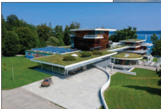
Buchheim Museum Franz Marc painting, Die Blauen Fohlen

On Tuesday, July 18th, an excursion is planned into the lake-country to the Southwest of Munich. About an hour from the city, Lake Starnberger is bordered by grand villas and gardens and is widely known as the site of 'Mad' King Ludwig's drowning. We will visit the lakefront Buchheim Museum containing -a priceless collection of Blauer Reiter paintings (Kandinsky, Gabriele Munter, Franz Marc) before an outdoor lunch at the nearby Klosterghasthof Andechs . A short walk uphill will take us inside the Benedictine Andechs Abbey , a fine example of 17th century Baroque architecture, before returning to the hotel in the late afternoon.