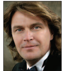
Klaus Florian Vogt

conducted by François-Xavier Roth with the sought-after German tenor Klaus Florian Vogt ideally cast as the romantic swan-knight. Opposite him will be South African soprano Johanni van Oostrum as Elsa, with German