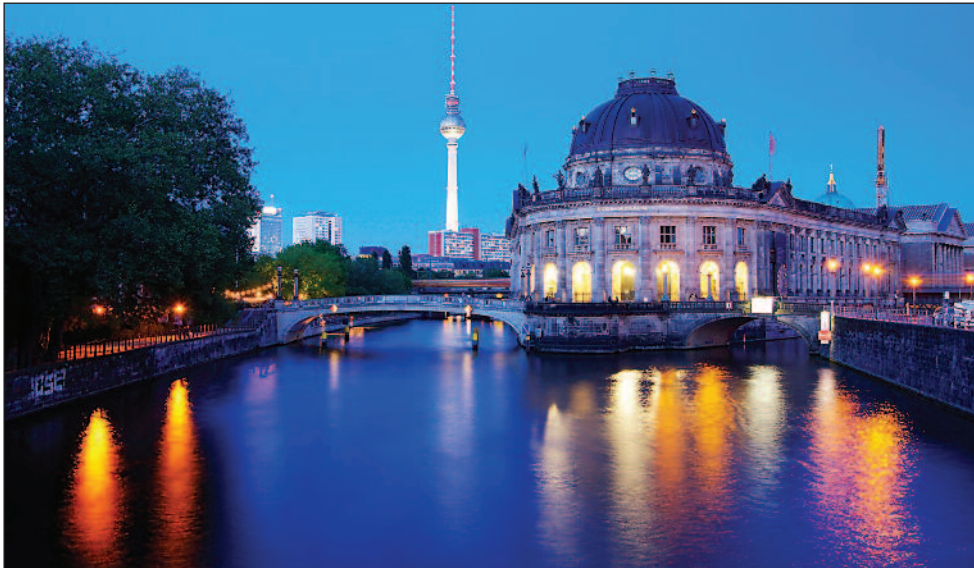
Berlin's Museum Island and the Bode Museum

"One of the most remarkable features of Wagner's works is the author's complete absorption of the times of which he wrote... In Der Ring des Nibelungen , he has done more – he has absorbed an imaginary epoch; lived over the days of gods and demigods; infused life into mythological figures."