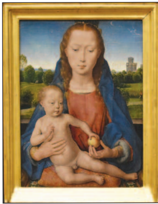
Hans Memling's Madonna and Child in the Gemäldegalerie

Mid-morning on Tuesday, May 21st, an orientation tour of Berlin will introduce you to the various districts of the city. En route we will view the major monuments along the famed boulevard