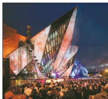
Royal Ontario Museum

The Canadian cultural capital of Toronto remains among our most popular spring destinations. In recent years we have encountered the Canadian Opera Company's varied repertoire including the world premiere of Rufus Wainwright's 'Hadrian', Tchaikovsky's 'Eugene Onegin', and last year's combination of 'Macbeth' and 'Tosca'. For the spring of 2024, we will return for an unmissable Canadian premiere of Cherubini's classic tragedy Medea (being mounted for the sensational Canadian soprano Sondra Radvanovsky ) and Donizetti's lyric comedy, Don Pasquale .