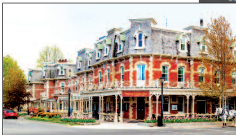
Niagara-on-the-Lake; Niagara Falls